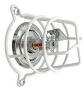
(4 Pack) Happy Tree Fire Sprinkler Head

Places to look for are at the top of the lower level (basement) steps, sprinkler heads located near doorways or in the lower level where the HVAC and Water Heater is kept.